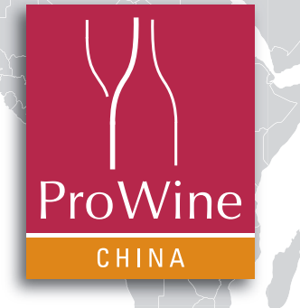
12-14 Nov 2019 Shanghai, China